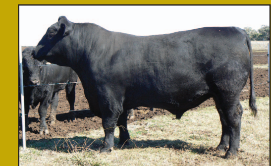
Raff Explosive E108

Weight 1,308 kg - Hip Height 63 inches His MVP's are exceptional for Rib Eye Area, Carcase Weight, Birth Weight & Feedlot Daily Gain