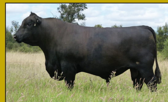
Raff Encore E110

Weight 1,088 kg - Hip Height 61 inches His MVP's are exceptional for Net Feed Intake