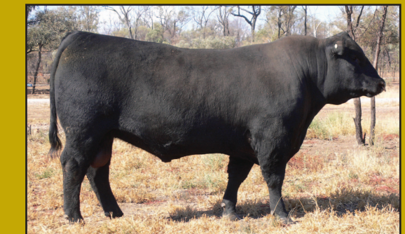
J & C Appeal A10