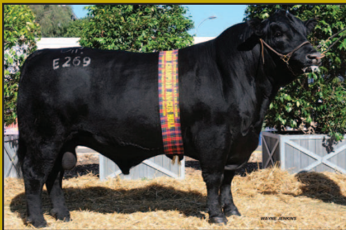
2012 Sydney Royal Show Supreme Angus Exhibit.