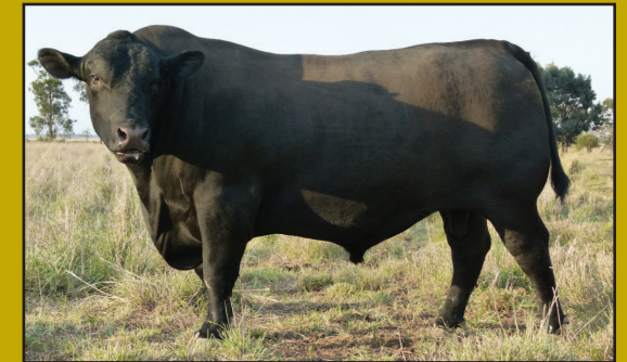
Raff Enforcer E41

Weight 1,310 kg - Hip Height 62 inches His MVP's are exceptional for Rib Eye Area, Birth Weight & Carcase Weight