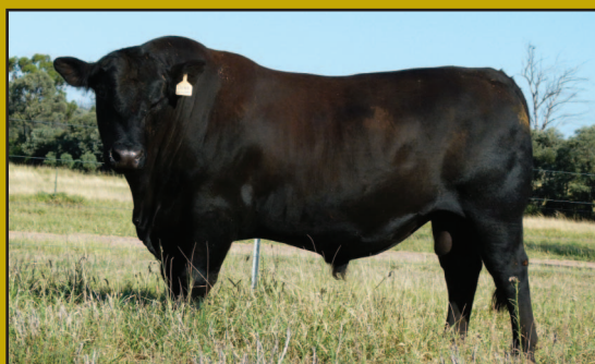
Raff Duke D367