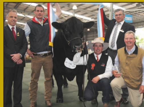
2011 Melbourne Royal Show Supreme Interbreed Exhibit.