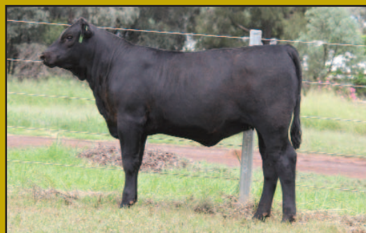
Raff Blackbird G306 ~ $17,000 high selling Empire daughter that sold at the March Raff Angus Female Production Sale this year.