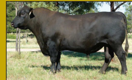
Raff Dakota D85