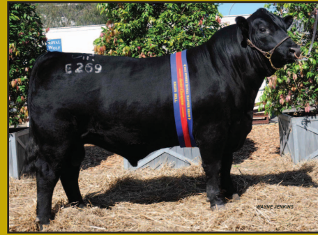
2011 Sydney Royal Show Junior Champion Angus Bull.