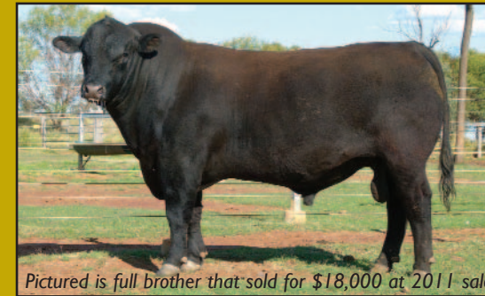
Raff Exterminator E201

Pictured is full brother that sold for $18,000 at 2011 sale