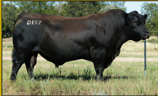
Raff Distinction D197

Weight 1,268 kg - Hip Height 60 inches His MVP's are exceptional for Rib Eye Area, Net Feed Intake, Birth Weight & Feedlot Daily Gain