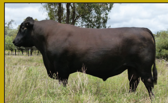
Raff Dallas D216