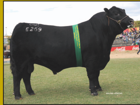
2011 Brisbane Royal Show Reserve Senior Champion Angus Bull.