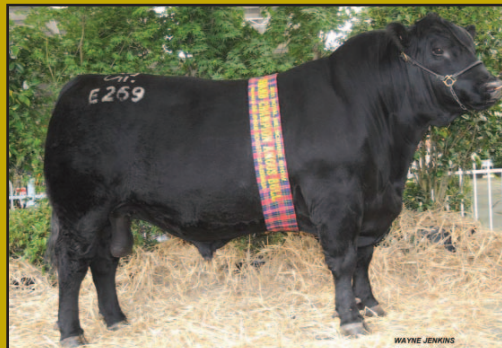
2011 Melbourne Royal Angus Feature Show Supreme Angus Exhibit.