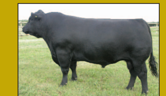
DMM Shift 78S