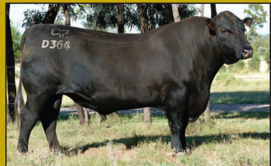
Raff Dictator D364