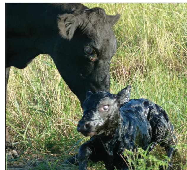
Within weeks of being born by simply taking a hair tail sample this calf will have genomic information on 16 traits including Feed Efficiency and Tenderness.

We have tested flush sibs at a young age and at maturity those MVP's largely reflect the subtle differences between flush sibs.