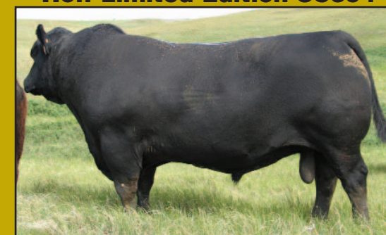
Hoff Limited Edition SC594