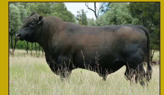
Raff Emperor E106

Weight 1,088 kg - Hip Height 61 inches His MVP's are exceptional for Net Feed Intake