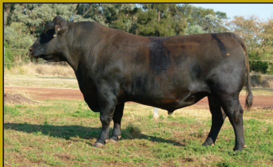
Raff Dynamite D345

Weight 1,044 kg - Hip Height 58 inches His MVP's are exceptional for Carcase Weight, Net Feed Intake & Tenderness Sold to R.L & G.M McIntosh Myanga Angus Stud NSW