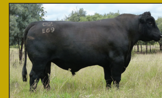
Raff Emblem E69