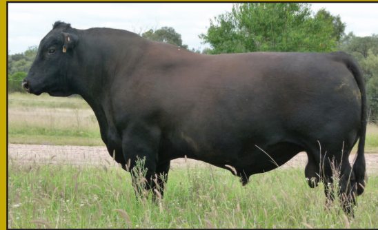
Raff Dazzler D353

Weight 1,044 kg - Hip Height 58 inches His MVP's are exceptional for Carcase Weight, Net Feed Intake & Tenderness Sold to R.L & G.M McIntosh Myanga Angus Stud NSW