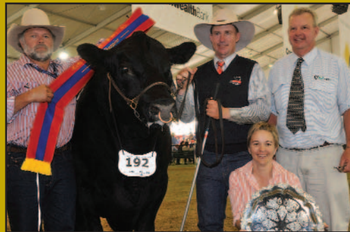
2012 Sydney Royal Show Senior & Grand Champion Angus Bull.