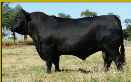
Raff Empire E269 several weeks after natural servicing 40 Raff Angus females.